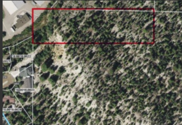
C-27103 Mammoth Creek A UDWR