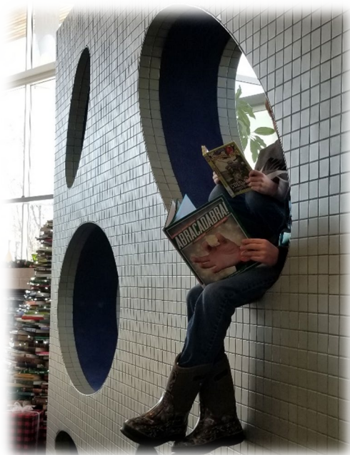
KIDS CHILLING (12/16/2022)