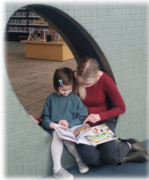
MOM & DAUGHTER CONNECTING (12/23/2022)