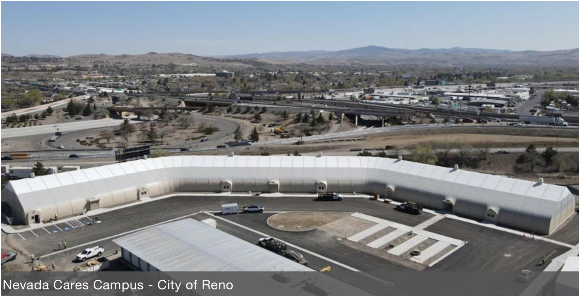
Nevada Cares Campus - City of Reno