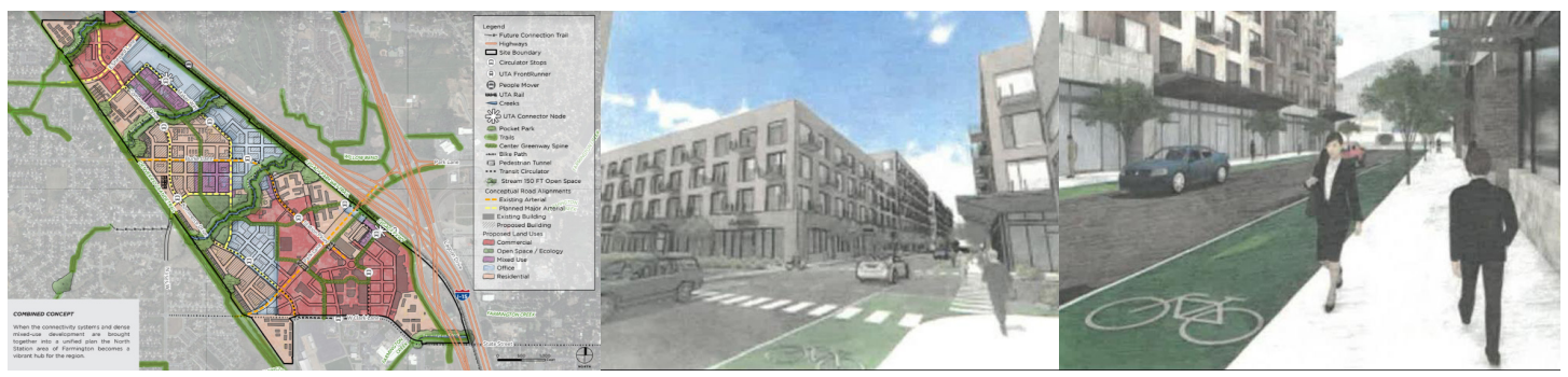
Farmington North Station Plan

Farmington City adopted a Station Area Plan for the Farmington North FrontRunner Station. The SAP includes an implementation timeline for the next 5 to 10 years which will activate the area to become a connected, mixed-use development containing residential housing (market rate and affordable), office/commercial, and open space uses. The plan seeks to expand housing choice and availability around the station, including approximately 4,500 new residential units - enough to accommodate nearly 15,000 new Farmington residents. Under the SAP, Farmington will explore innovative alternative transit options to connect people within the station area (which can be more than ½ mile) to the station and a mixed-use center, which the city has already initiated.