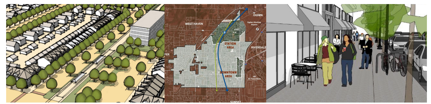
Higher density around FrontRunner station

After extensive public engagement, Roy City created the <u>Focus Roy City</u> vision for their community, which then led to the adoption of a Form Based Zoning Code for their FrontRunner Station. Roy's Form Based Zoning Code will help transform the station area through zoning changes into a transit oriented development with a mix of uses, including affordable housing options and office/commercial development, as well as connectivity for pedestrians and bikers to best leverage the development's proximity to public transportation. This plan is beginning to come to life as the market responds with a proposal to construct nearly 300 townhome units within the station area.