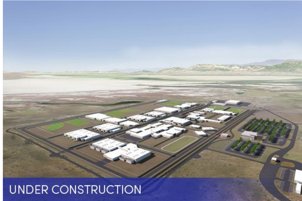
State of Utah DFCM, Layton Construction