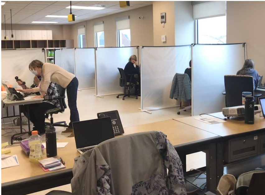
Election Office Warehouse