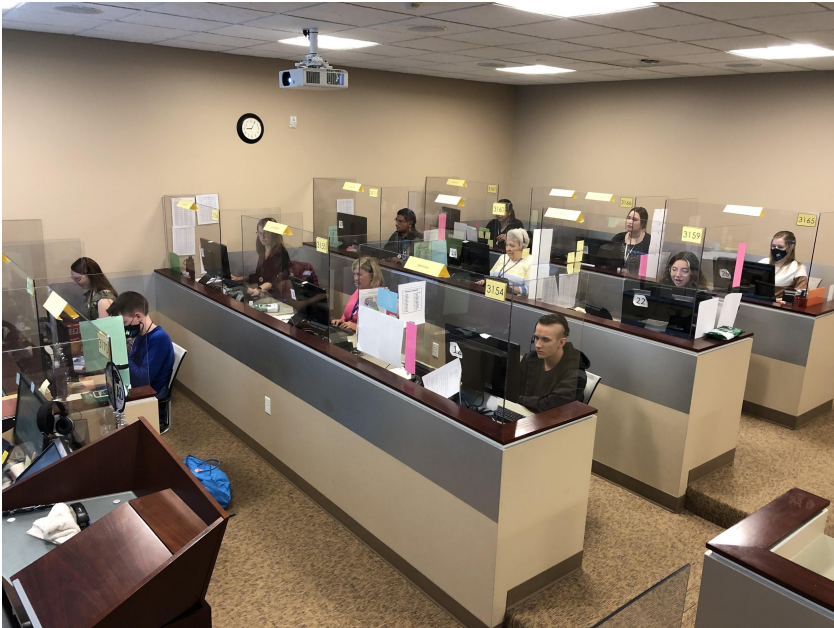
Computer Training Room