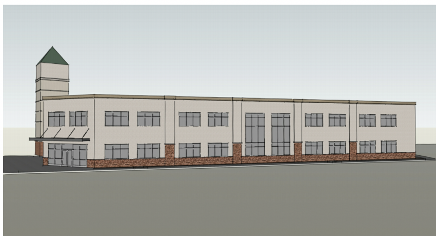
SUNSET CORNERS JMI CONSTRUCTORS OPTION 1