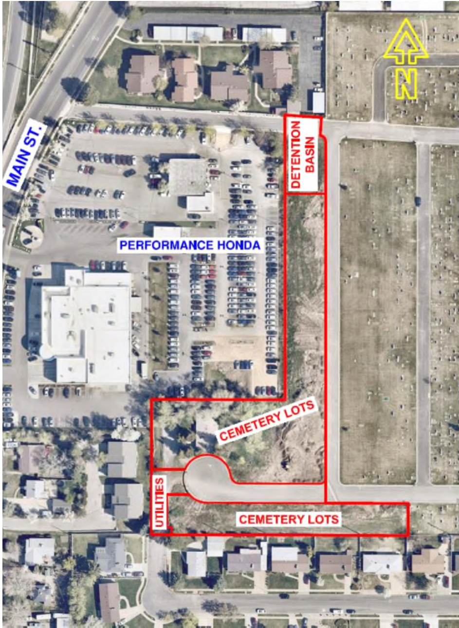
Aerial Photo of the Bountiful City Cemetery Plat R

Aerial photo of the Plat R area A copy of the Bountiful City Cemetery Plat R Final Plat.