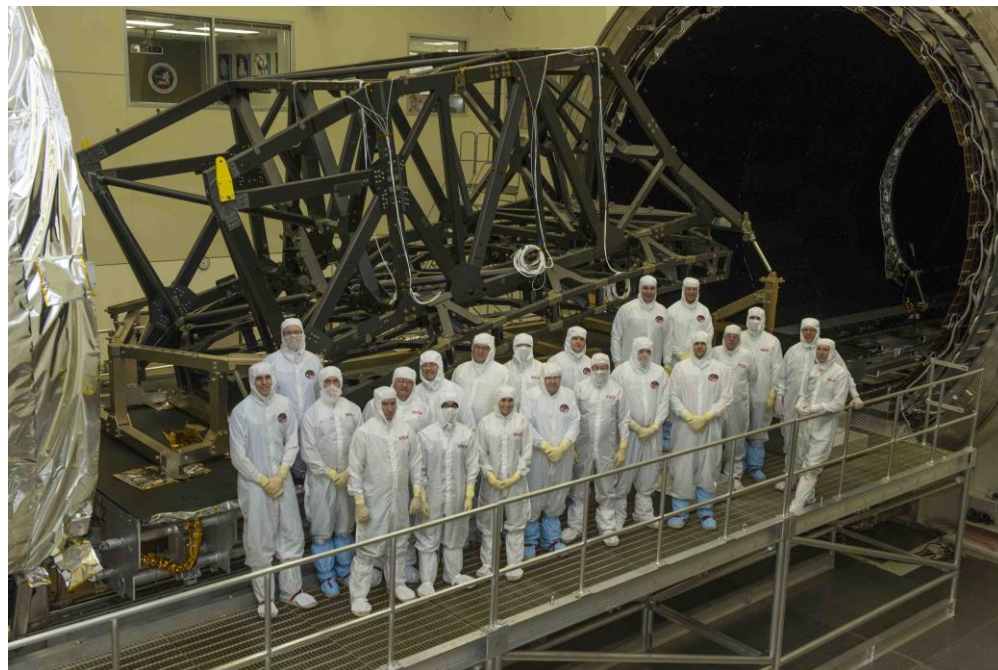
Cryogenic test chamber at NASA's facility in Huntsville, AL