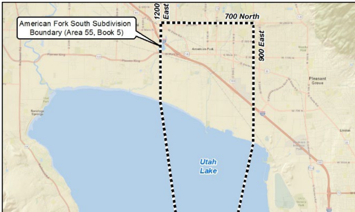
Figure 1: American Fork South Subdivision (55-5) Boundary

A search of our records indicates that you may be an owner (or owner’s agent/legal counsel) of property or a water right within the boundary of the American Fork South Subdivision (see Figure 1).