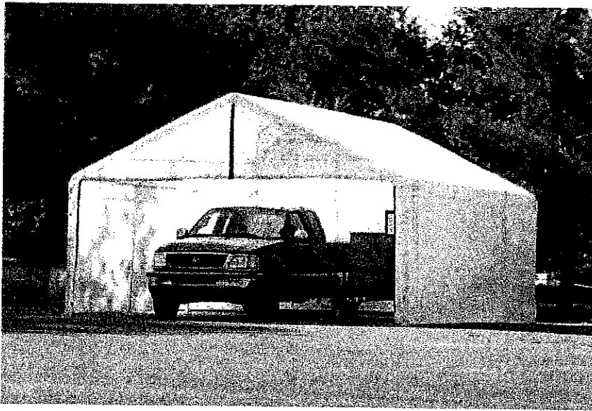
2000 image of 1 Canopy with Enclosure Kit