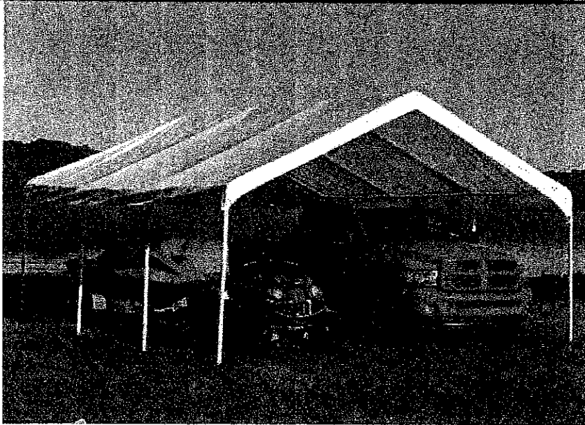
Canopy with/out Enclosure Kit