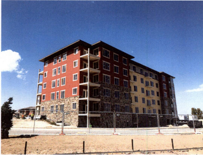
Residential Unit Building—photos taken 9/17/18

Residents will move into more than 40 units in the first residential tower in October, with most of the units scheduled to be occupied this year. Flooring, kitchen appliances and washers and dryers have been installed in most units. Summit Vista has hired more than 40 employees who are in training and ready to go when the first residents move in. More employee hiring are in process.