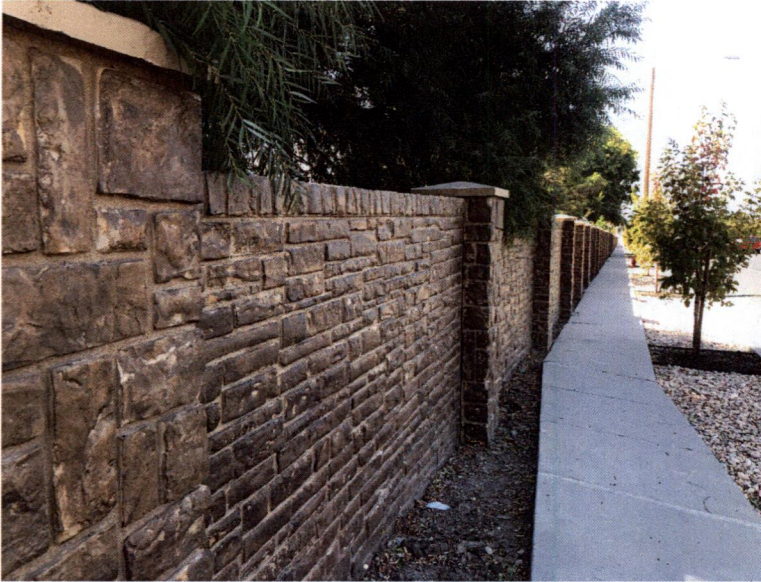
4700 South Wall—photos taken 9/17/18

Construction of the 4700 South wall is complete with only a small amount of concrete infill to finish. Construction of the 3200 West wall is complete with only a small amount of concrete infill to finish. The landscape contractor has finished punch list items and submitted their final invoice. City engineers are also working with the landscape contractor to make a couple of small wall/fence improvements at Cabana Park.