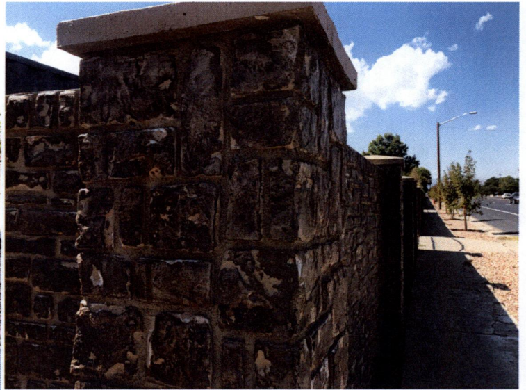
3200 West Wall—photos taken 9/17/18