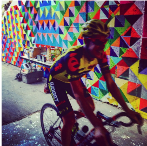
Poison Creek Tunnel Mural