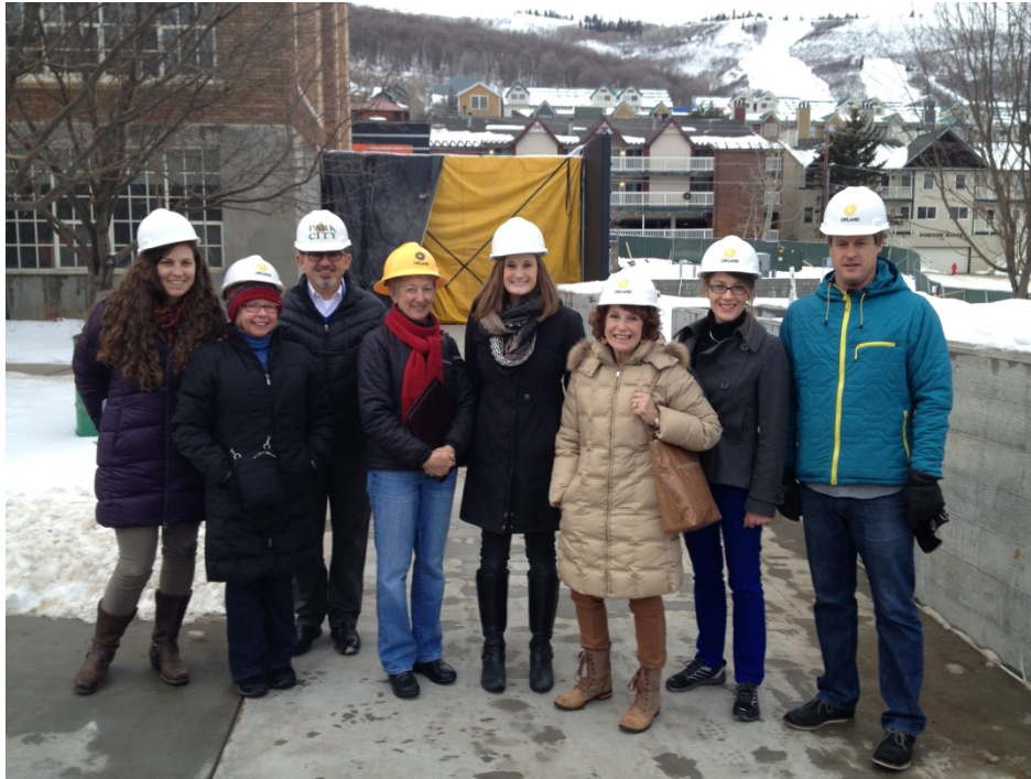
PAAB meet to plan Library artwork