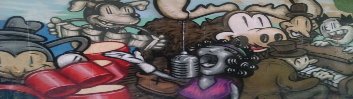
Deer Valley Drive Tunnel Mural by Trent Call, 2012