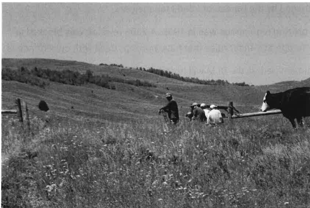
A cow looks on as a crew works on a fence in Wyoming.

The Department of the Interior continues to ask for public input on a proposal to update how livestock grazing is managed on public lands. The Bureau of Land