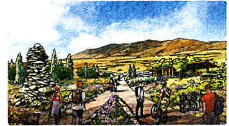
*All renderings and maps are conceptual in nature and are subject to change.