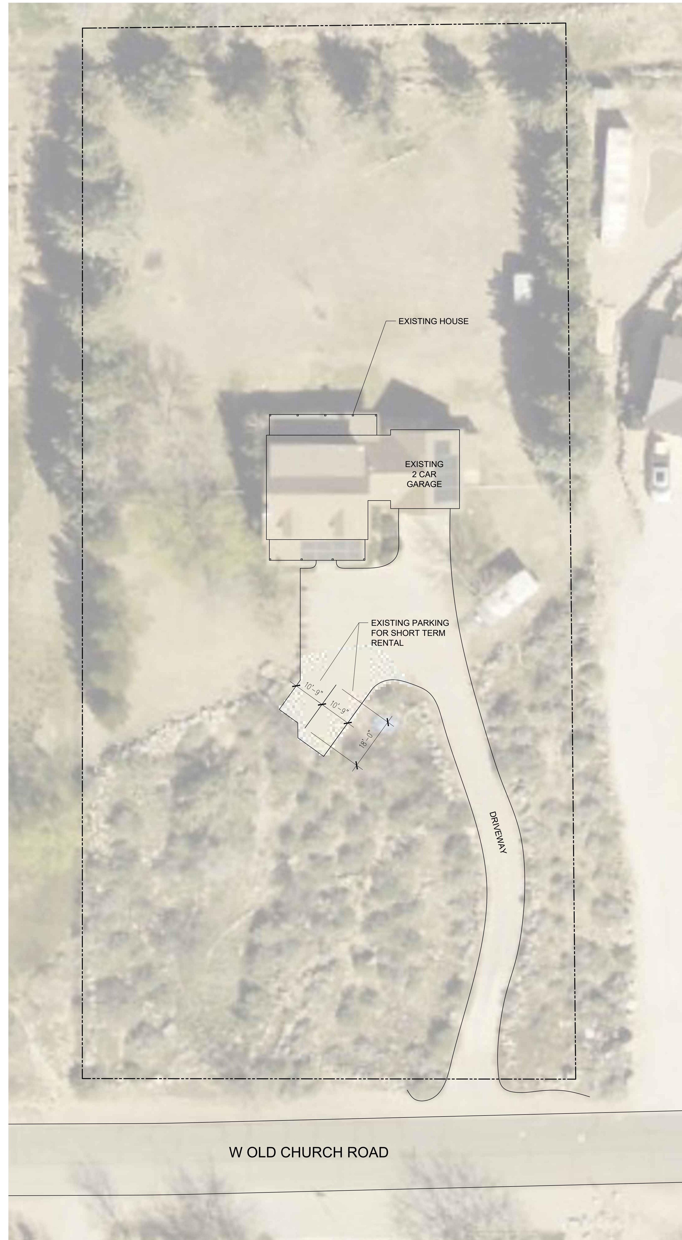
1 SITE PLAN SCALE: 1/16" = 1'-0"