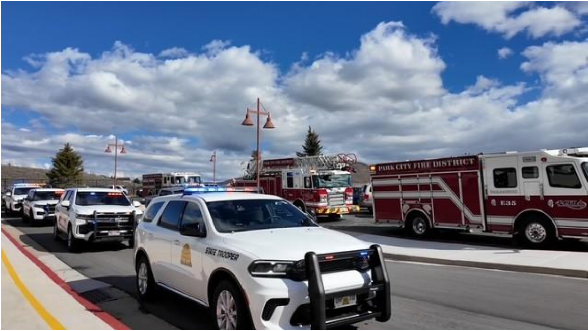
Multi-agency active shooter drill at Trailside.