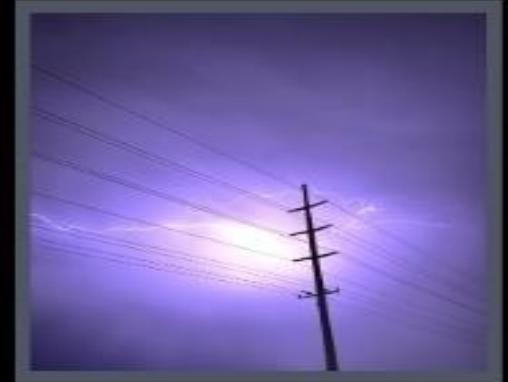
3rd Place Annell Age 14