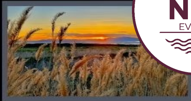
2nd Place Clif Bradford