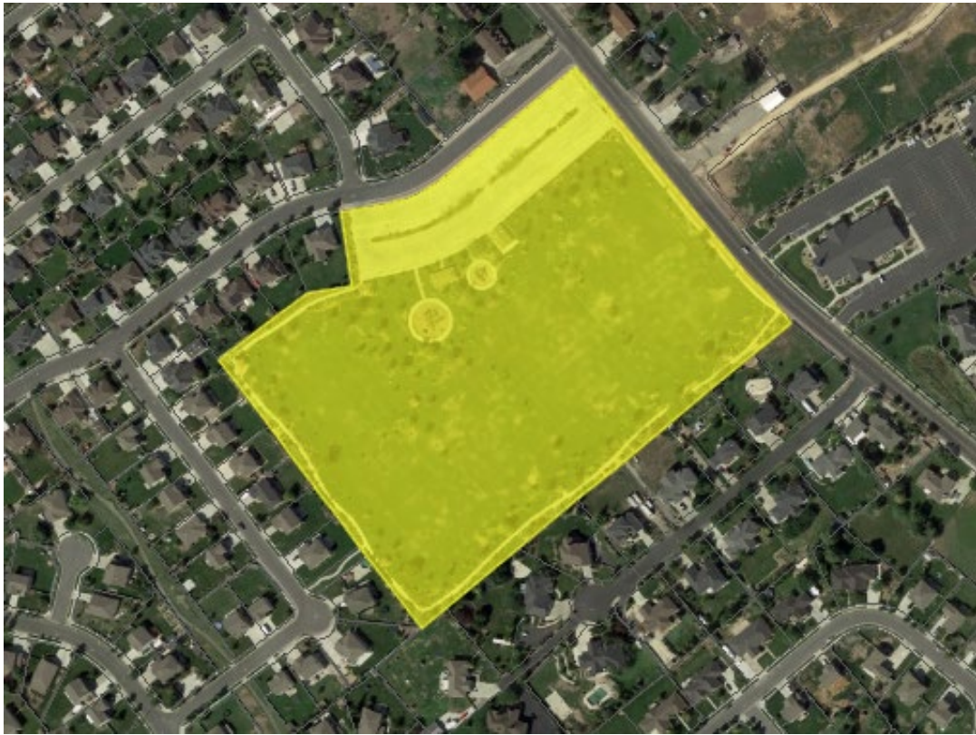
Angel Street Park