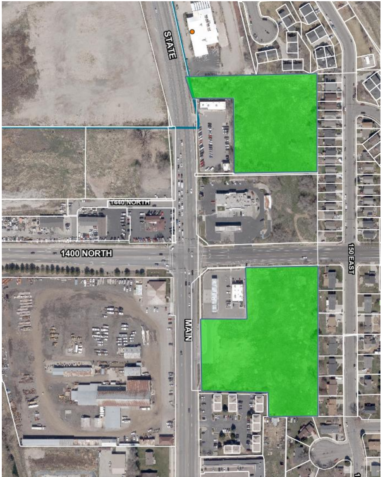
1450 and 1300 North Main Street - Location Map