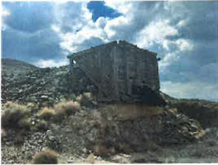
Ore chute.jpeg 143K