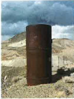
Water tank.jpeg 143K