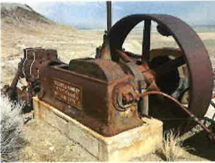
Hoise assembly-front.jpeg 174K