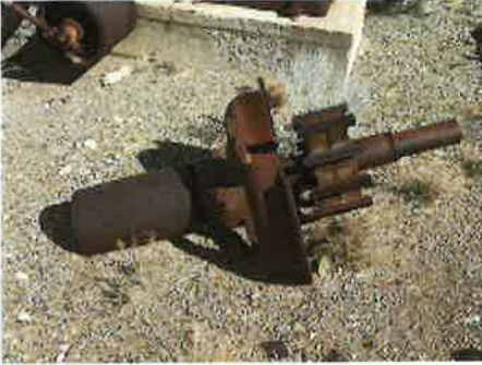
Moter piece.jpeg 230K