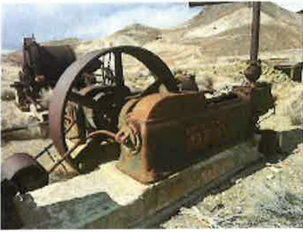
Hoist assembly-back.jpeg 180K