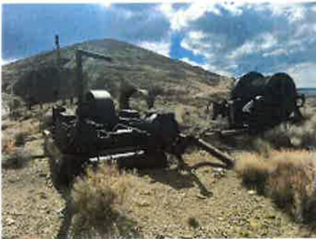
Site Photo.jpeg 176K