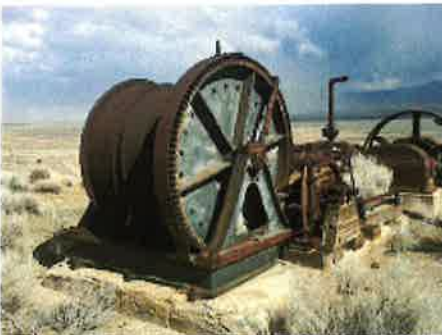
Cable system.jpeg 160K