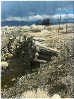
Stemming 1.jpeg 201K