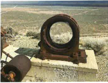
Motor housing.jpeg 185K