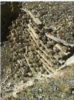
Stemming 2.jpeg 257K