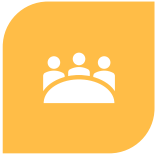
PARK ADVISORY COMMITTEE (MSD + COMMUNITY REPS)