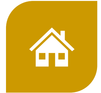
PUBLIC OPEN HOUSE