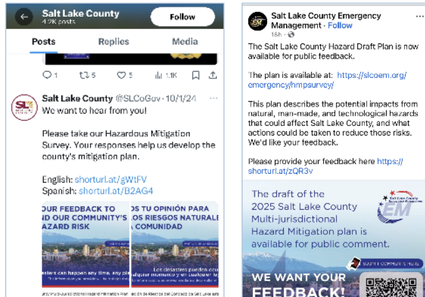
Figure 1: Social Media Posts for the Hazard Mitigation Survey (left) and Draft Plan Review (right)

White City provided several opportunities for public participation. Figure 1 presents examples of public outreach.