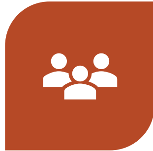
COMMUNITY SURVEY + PUBLIC MEETING(S)