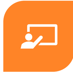
COUNCIL/PLANNING COMMISSION PRESENTATIONS DURING ADOPTION PHASE