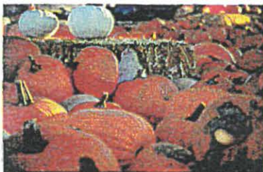
Washington County, Utah