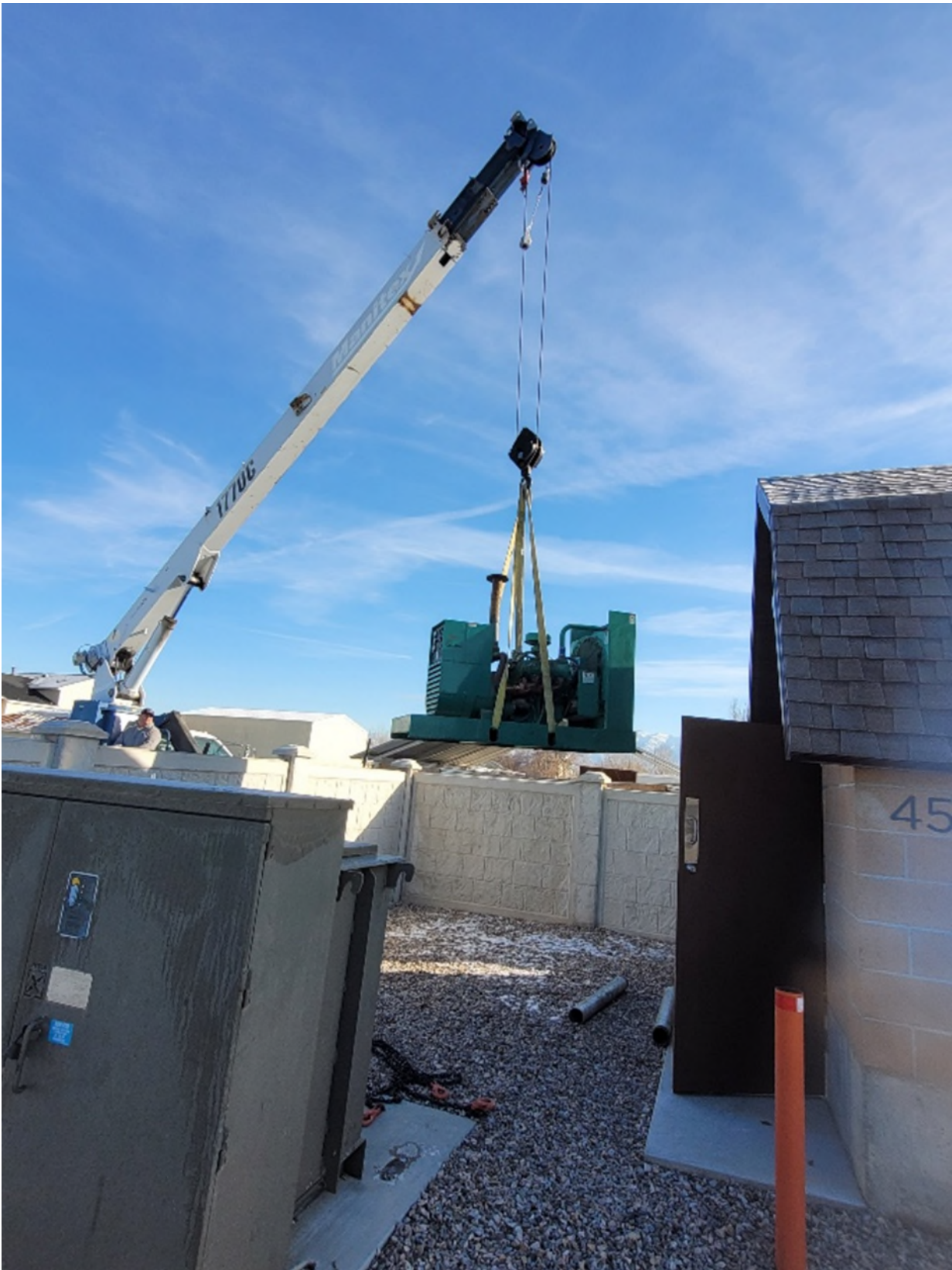
Old Generator coming out of the building.