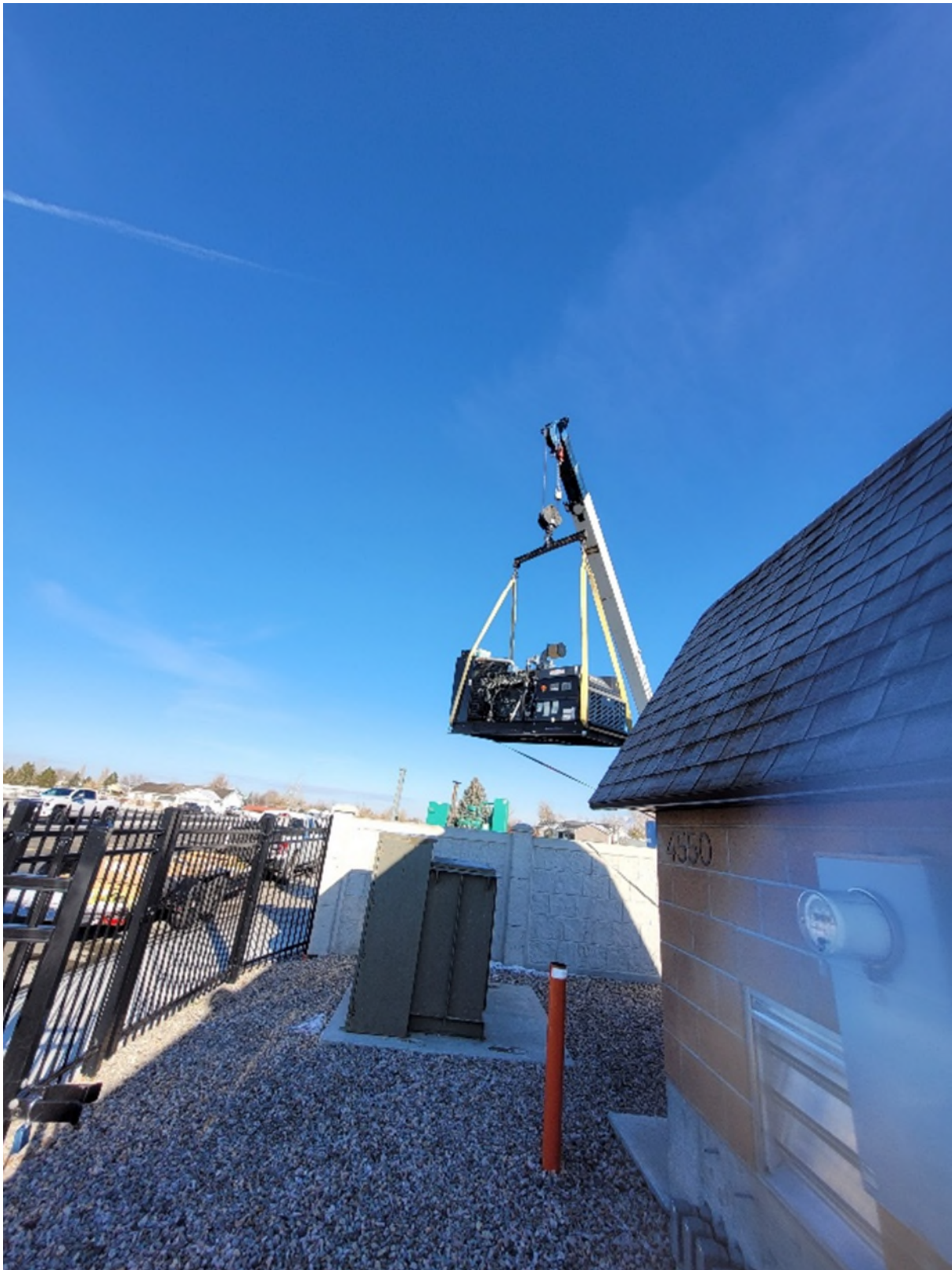
The new Generator is going into the building.