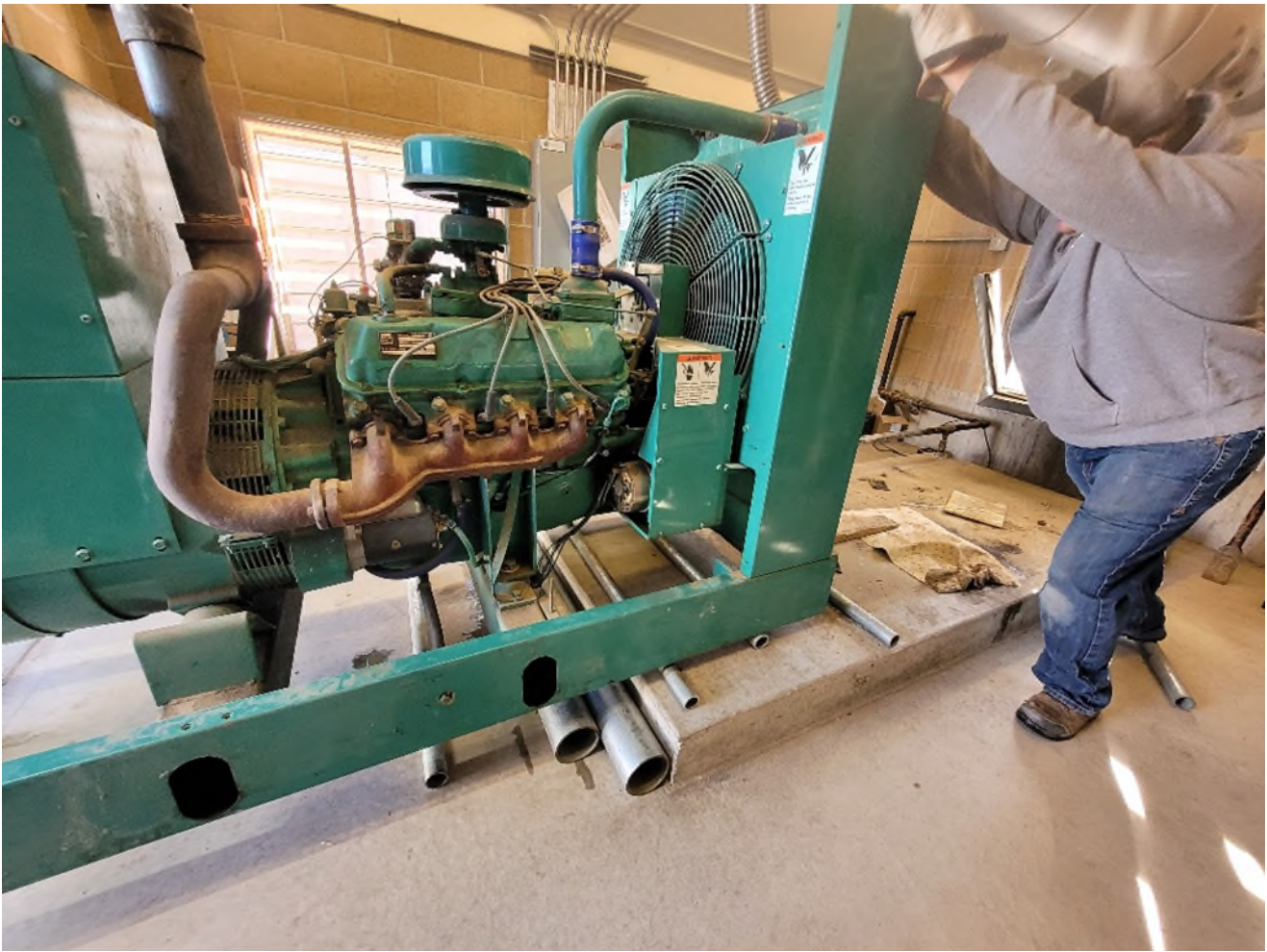
Moving the old Generator.