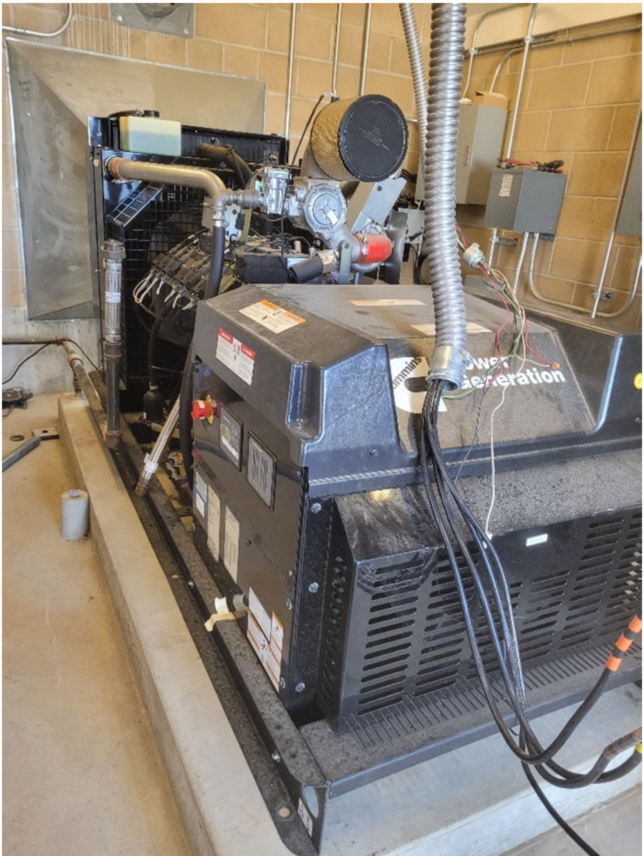
New Generator being installed.