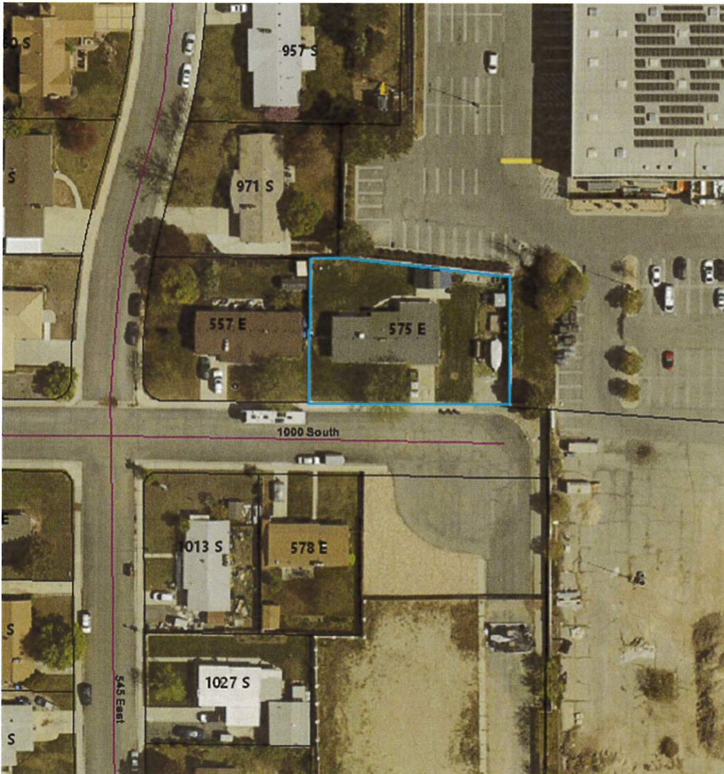
Subject property, 575 East 1000 South (approximately .31 acres)