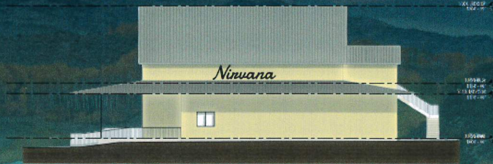
SIDE BUILDING ELEVATION RENDERING