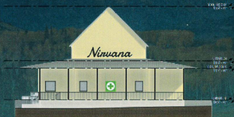
FRONT BUILDING ELEVATION RENDERING