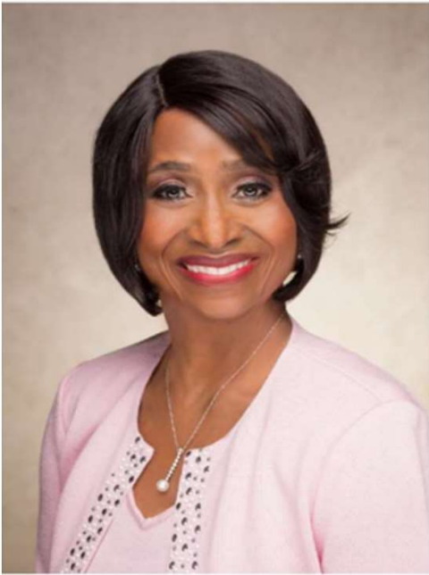
Hon. Shauna Graves-Robertson