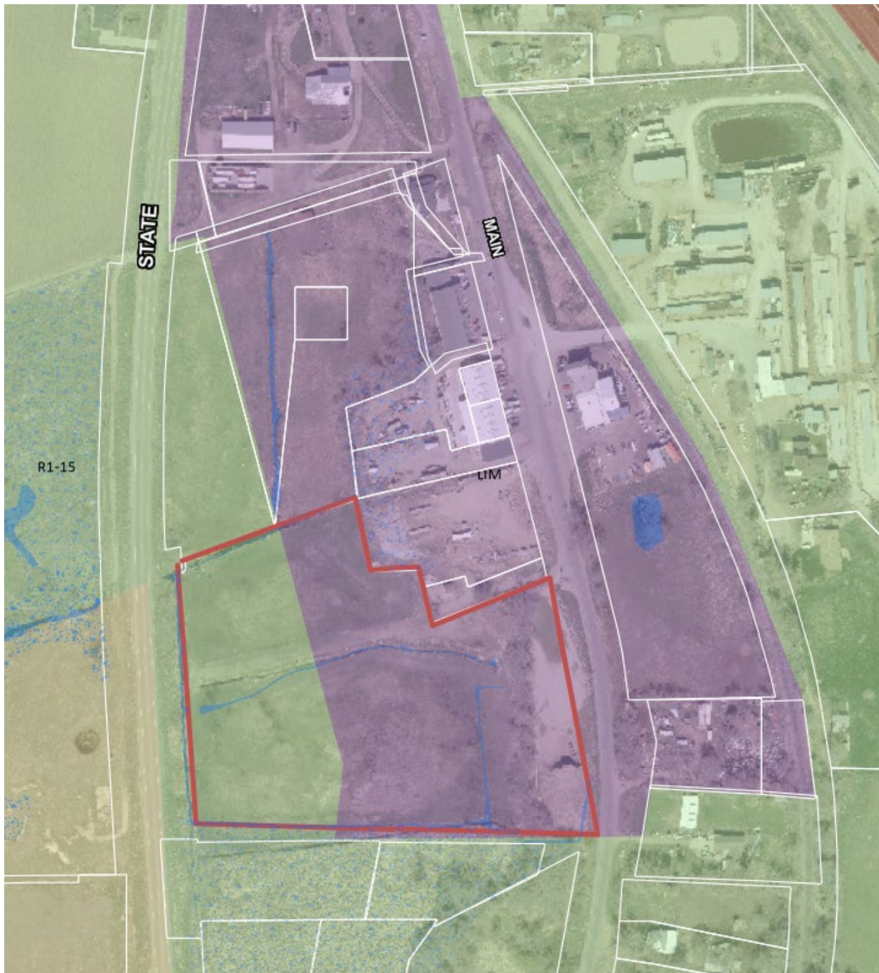
EXHIBIT A-PARCEL 26:026:0046 ZONING