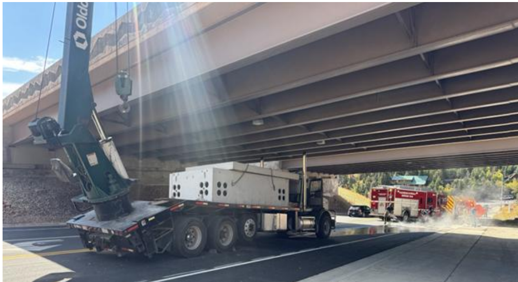
September 22 – Crane Strike / Hazmat Spill, Summit Park (B Platoon)

Units from Station 33 and 35 responded to a single-vehicle rollover with one patient trapped. The patient was extricated and transported in stable condition.