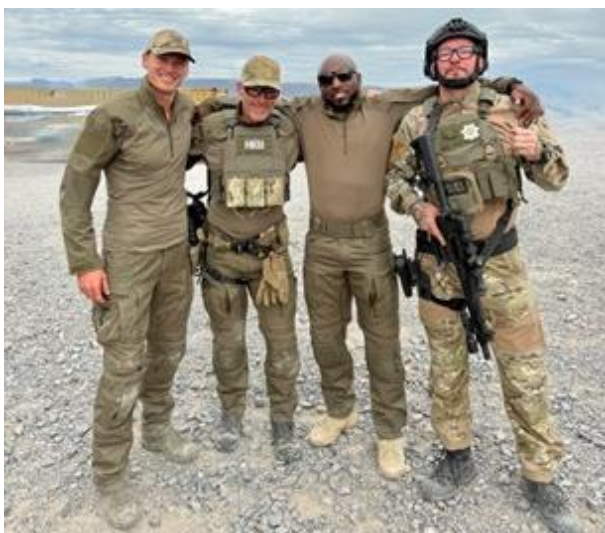
SWAT Medic Training – BTOC Graduation (Training Division)

The SWAT Medic Program reached a defining stage as PCFD medics completed the Basic Tactical Operations Course (BTOC). The six-day, five-night course integrated tactical combat casualty care, team movement, and mission planning under fatigue and stress. Medics will next attend POST/SFO certification to formalize law enforcement authority under the Summit County Sheriff's Office.