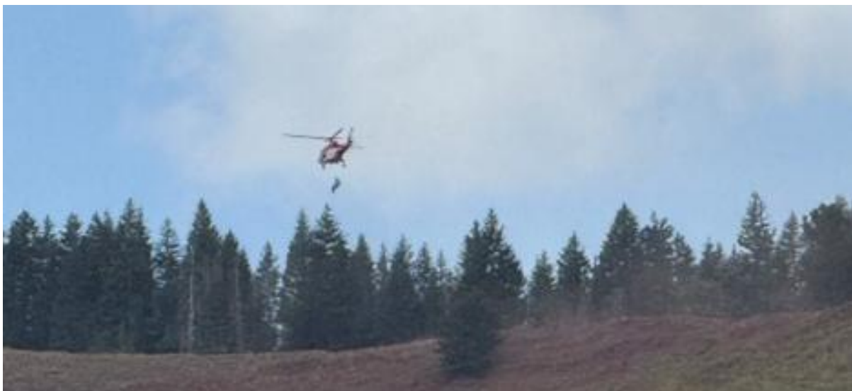
Helicopter Hoist Rescue, Wasatch Crest (C Platoon)