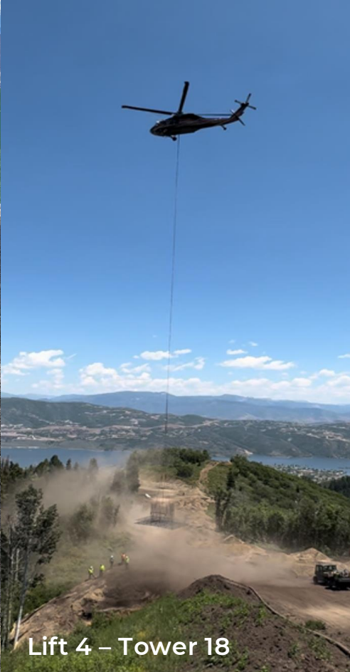
Lift 4 – Tower 18