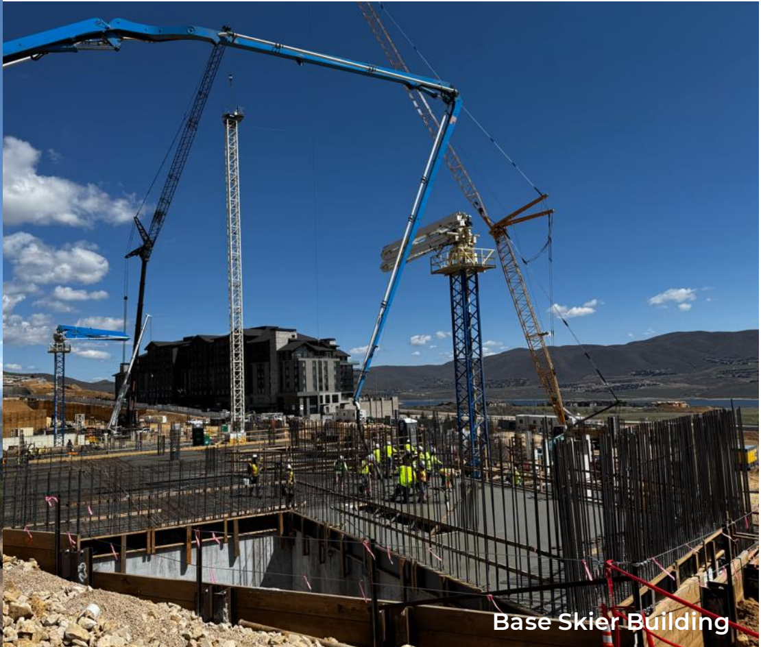
Base Skier Building