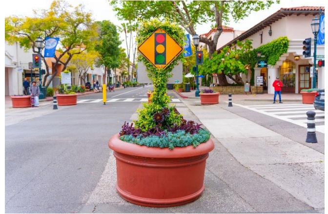
Low cost traffic calming

Similarly, some streets require only minimal upgrades to turn them into a comfortable corridor. For example, missing sidewalk sections and poor lighting were very common issues discovered during public outreach. Improving these does not require rebuilding an entire street, but it can make a big difference on the street's usability.