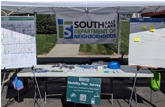
Outreach booth at Craftoberfest 2024

During summer and fall of 2024, city staff heard from residents and stakeholders about how South Salt Lake's transportation system is working for them and how it can be improved. Outreach was done in person at city events as well as online.