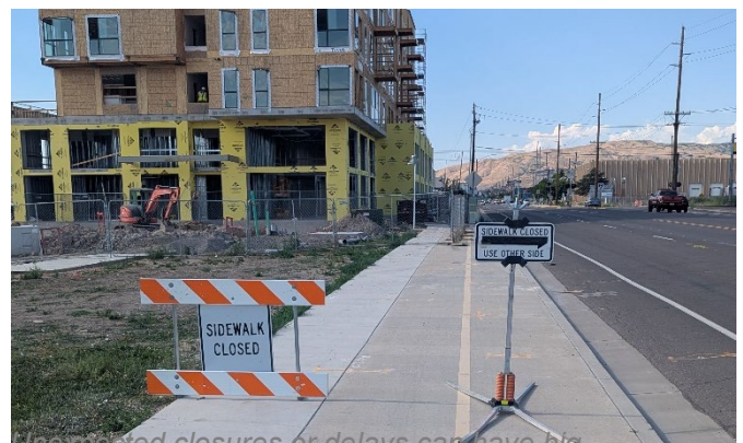
Unexpected closures or delays can have big consequences for residents and travelers

A webpage, or social media may work best for others. The method and level of effort will depend greatly on the project and the impacted parties, but the concept remains the same: people want to know what's happening, and they want their