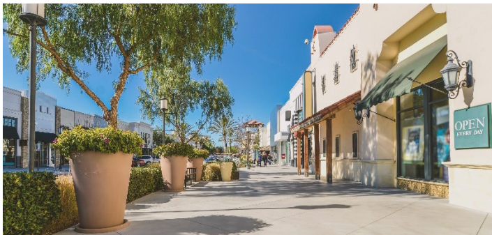
An example of a sidewalk fit for a walking loop

Finishing and implementing the City's Vision Zero and Traffic Calming Policies are imperative to resident health and well-being.