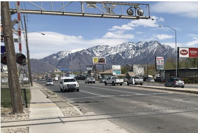
3300 South, the only continuous East-West street through the center of the city

Residents expressed frustration with their ability to navigate the city from East to West, with and without an automobile. Other than Parley's Trail on the North end of the city, no safe, continuous connections exist across town. Myriad rail lines, I15, and State Street all present major barriers to mobility. High priority projects to bridge this divide are: