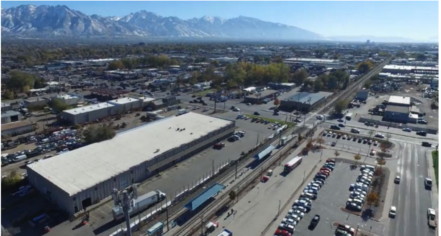
Much of the Salt Lake Valley is characterized by single-story buildings with large setbacks and parking lots

By segregating land uses into highly specific zones, many land use codes mandate large distances between homes, workplaces, and stores. Distances between places are further increased by minimum lot sizes, required parking lots, setback requirements, and other density limitations. Highly specific zones make it very unlikely that a parcel will be available for purchase in the same location as the demand for that development type. This raises the cost of urban