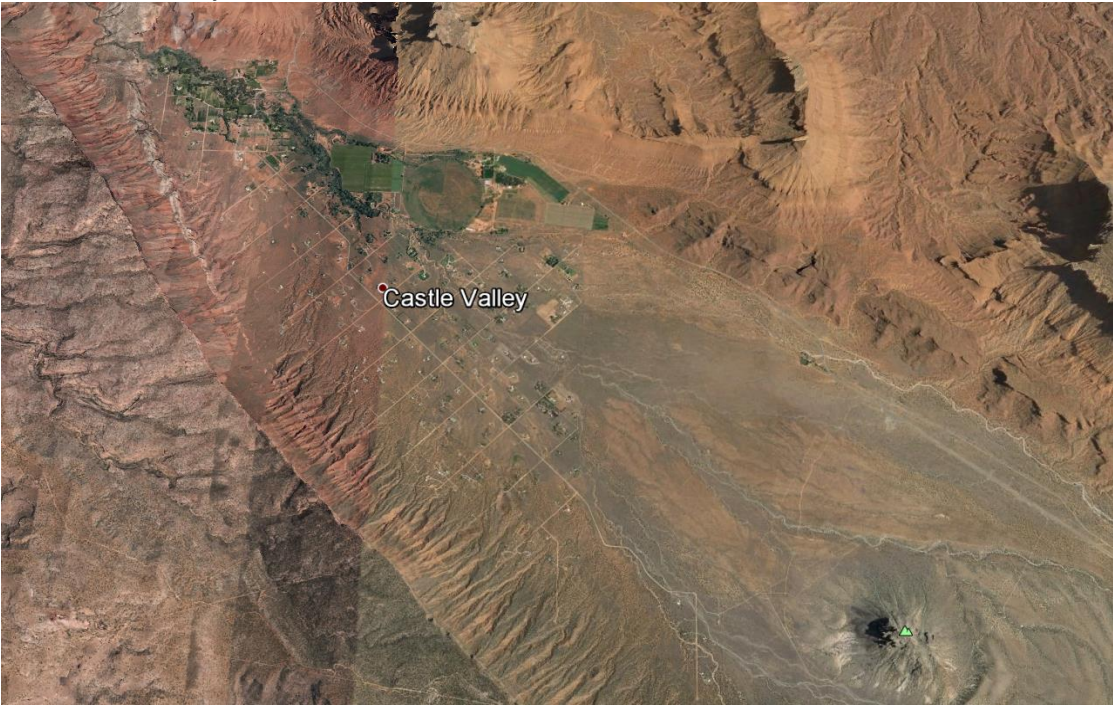
Town of Castle Valley Overview