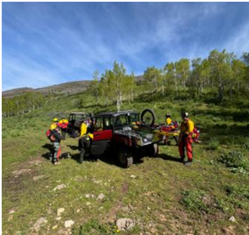
Saw Class Field Day