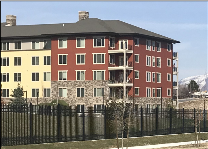
Illustration 7.2.2 Senior Housing.

As seniors become a larger percentage of the overall population, senior oriented housing communities, such as Plymouth View Senior Housing [above] and Summit Vista [below], provide much needed housing for elderly populations.