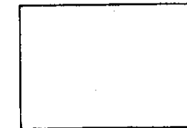
AREA OF ANNEXATION PETITION