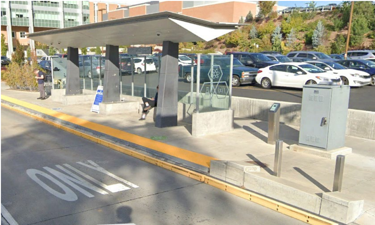
existing station platform on BYU campus