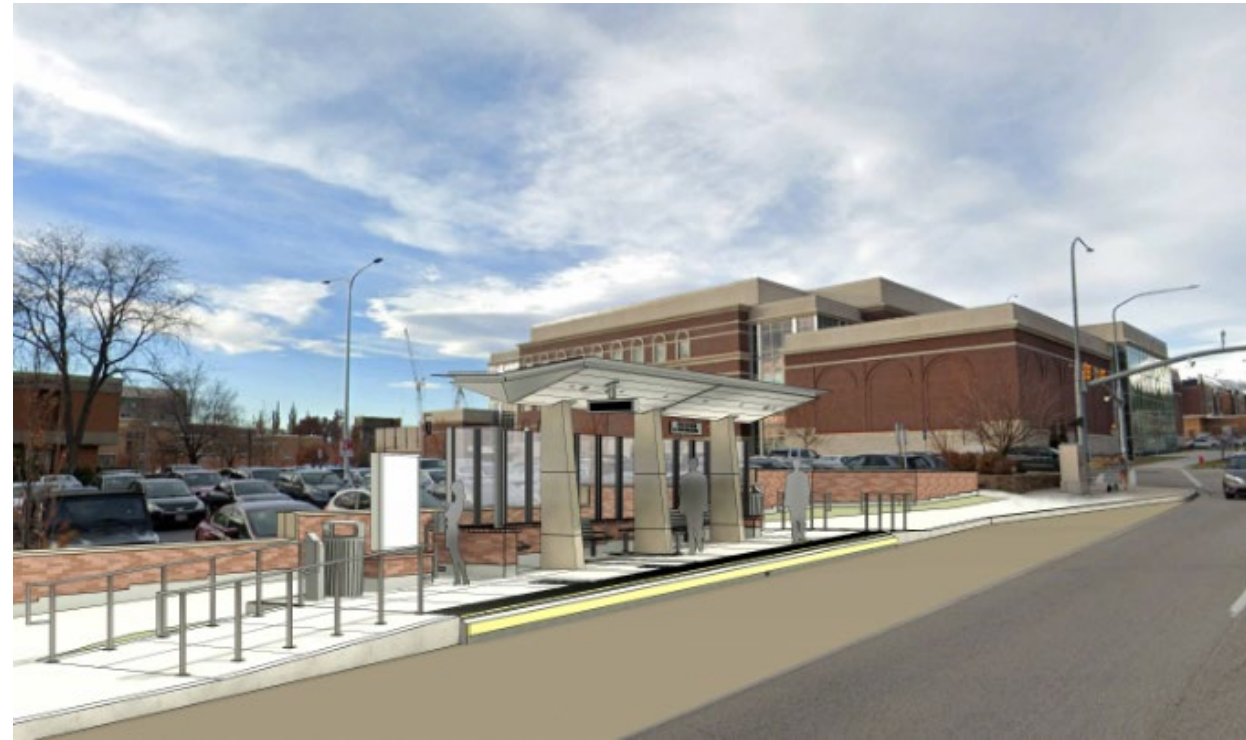
sample rendering of southbound platform