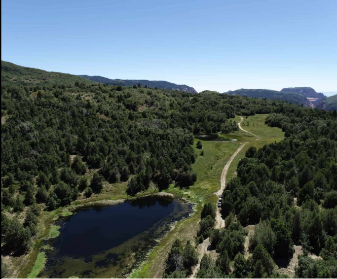
North Kolob Parcel