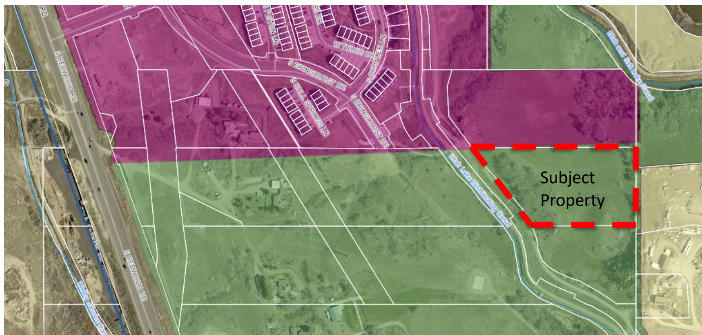
Figure 1: Zoning Map (Current: Agricultural A-5, Proposed: SD-X Bringham Station)