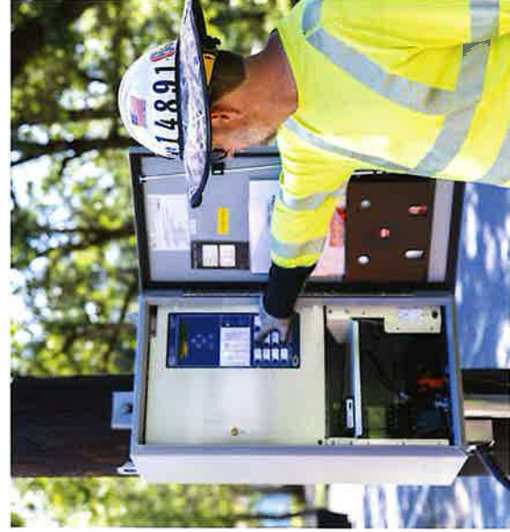
Advanced recloser control