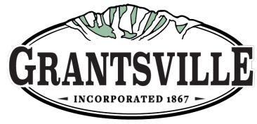
EXHIBIT A (Tier 2 Pick-Up)