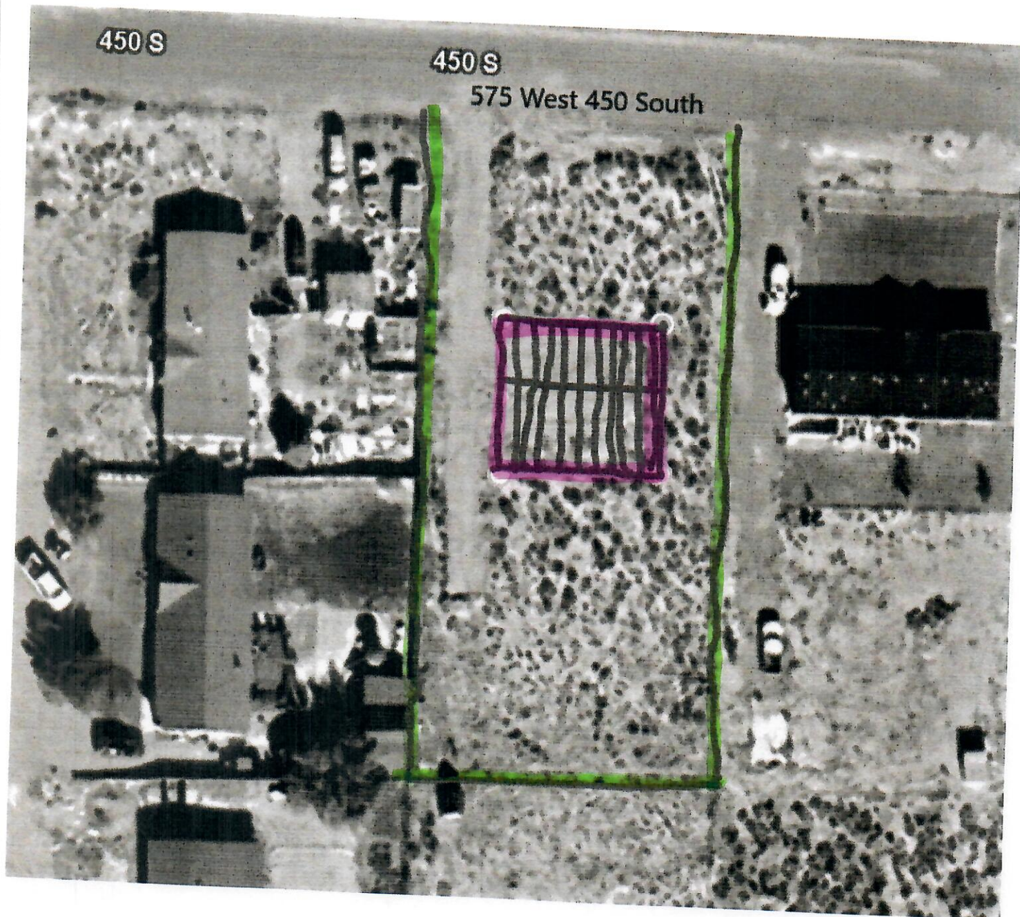
Additional Site Plan image: aerial view with neighboring houses