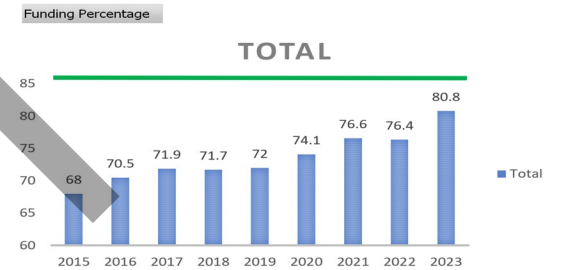
Appropriation History by Expenditure Category