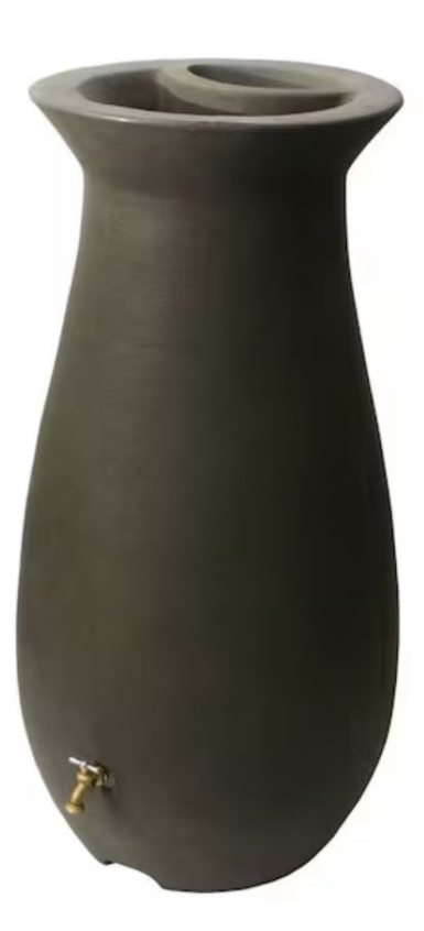
Hover Image to Zoom