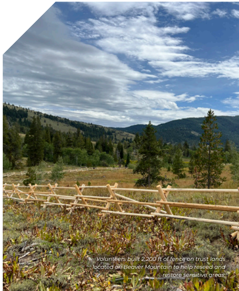
Volunteers built 2,200 ft of fence on trust lands located on Beaver Mountain to help reseed and restore sensitive areas.

In addition to the new website, a robust social media outreach and education campaign began in the summer of 2023. The social media channels allow the Administration to engage with beneficiaries and their supporters to keep them informed on issues surrounding Trust Lands.