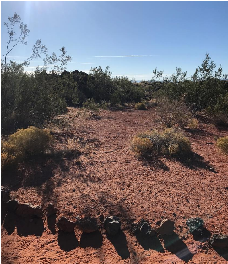
Image 2: Proposed location of facility viewed from the existing Scout Cave trail.