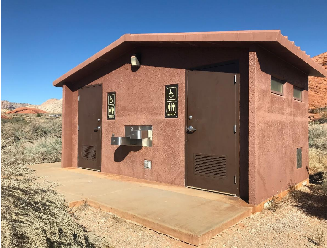
Image 3: Proposed style and footprint (18' x 21') of restroom facility and walkway.