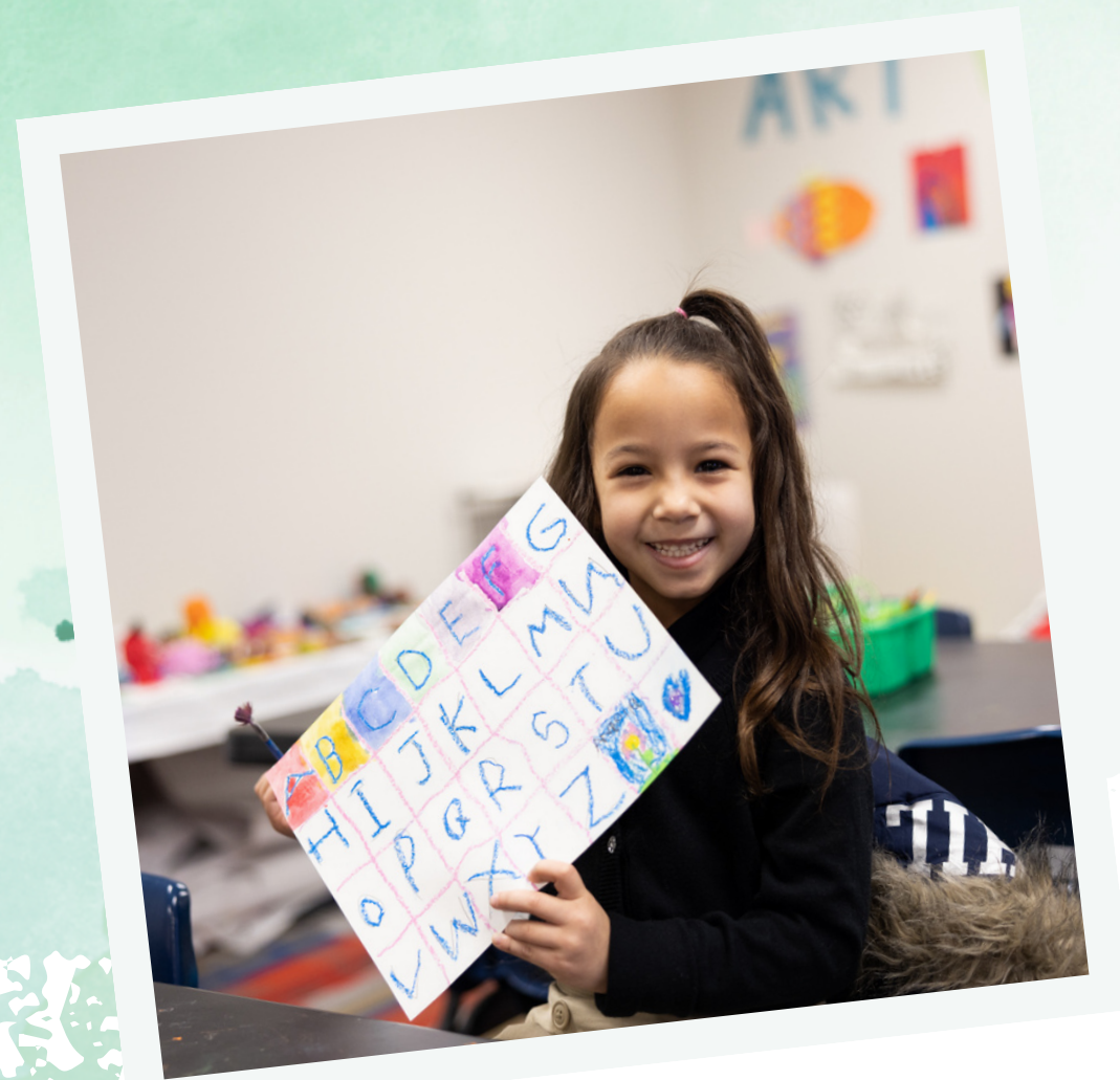
English Language Learner Support