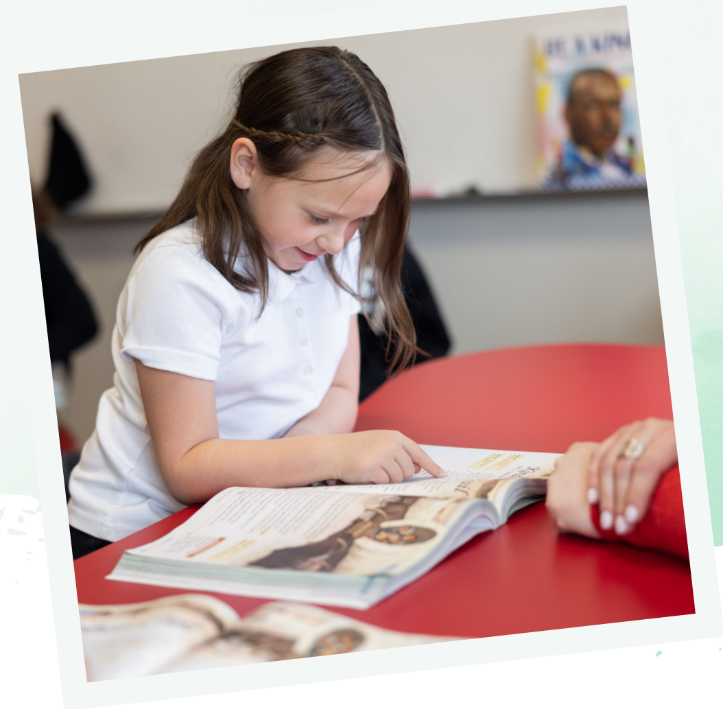
Increased Literacy Progress Monitoring