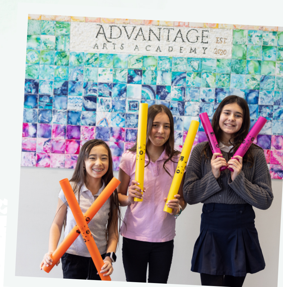
Drama/Theater Specialty Class