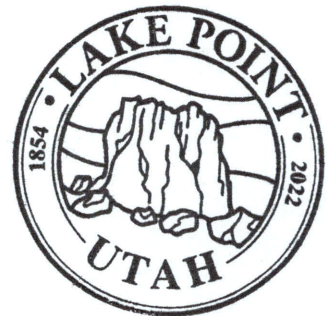
Exhibit A 05.10.2023