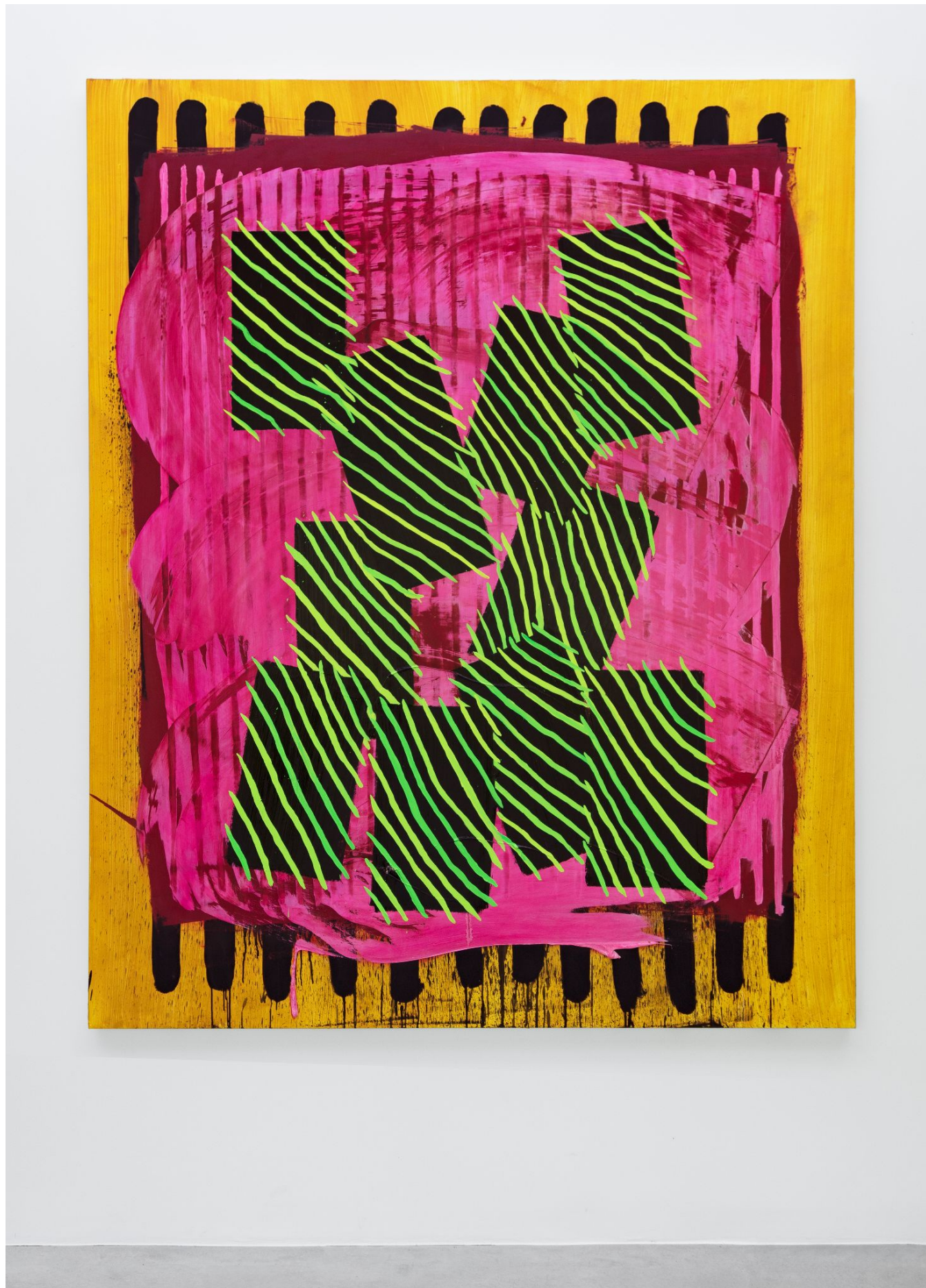
The Devil in My Dreams