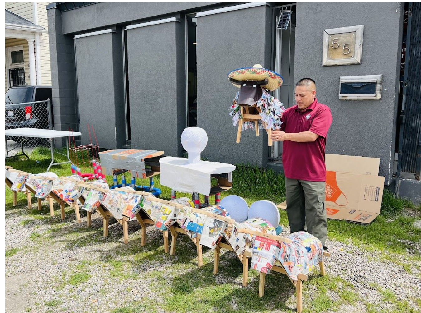
Torito Tiliche (Wooden Tiliche Bull) - wood, paper mache, paint -$400