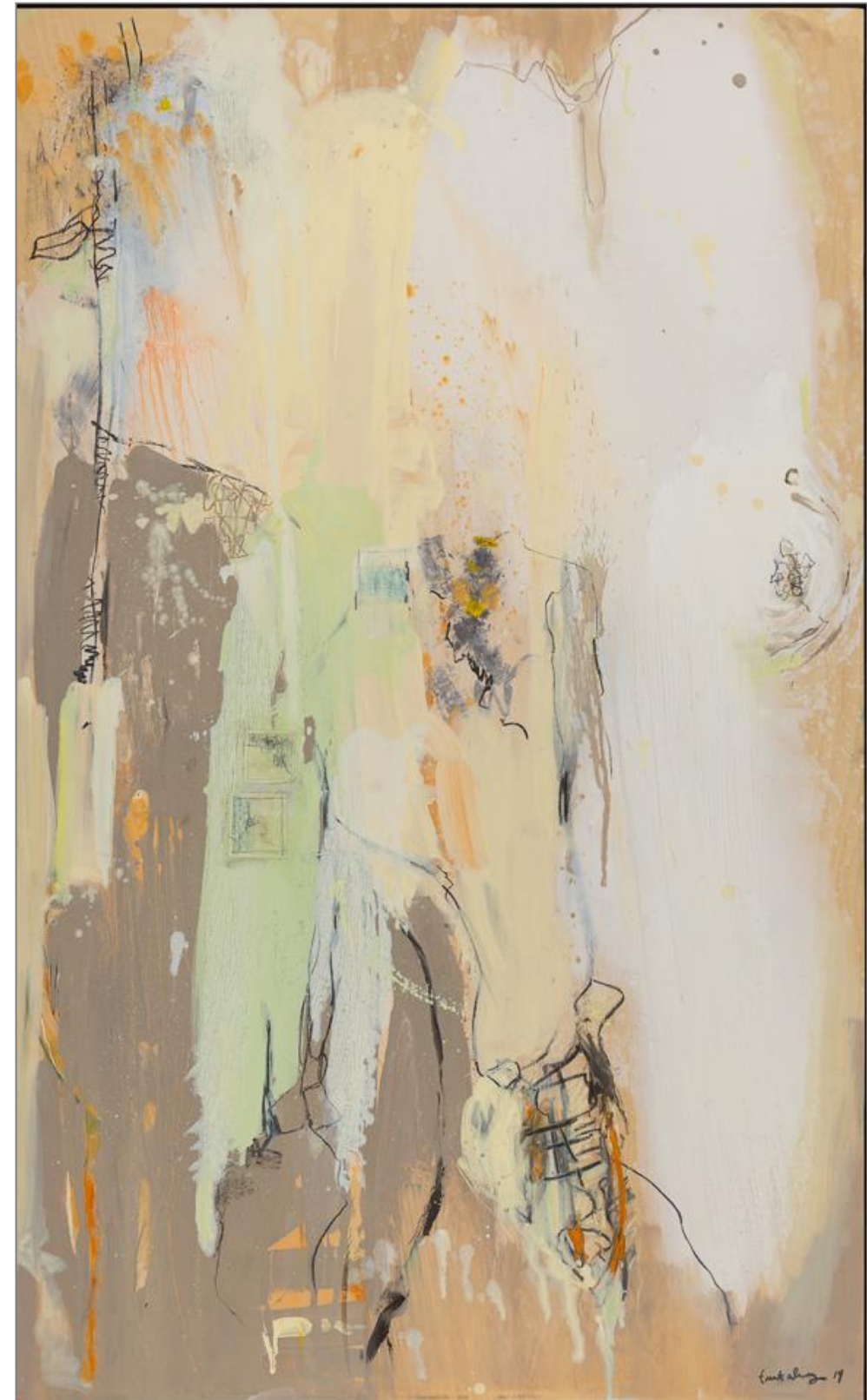
Emigration Canyon Fall Oil on panel 2014 Companion piece already in AMH Collection