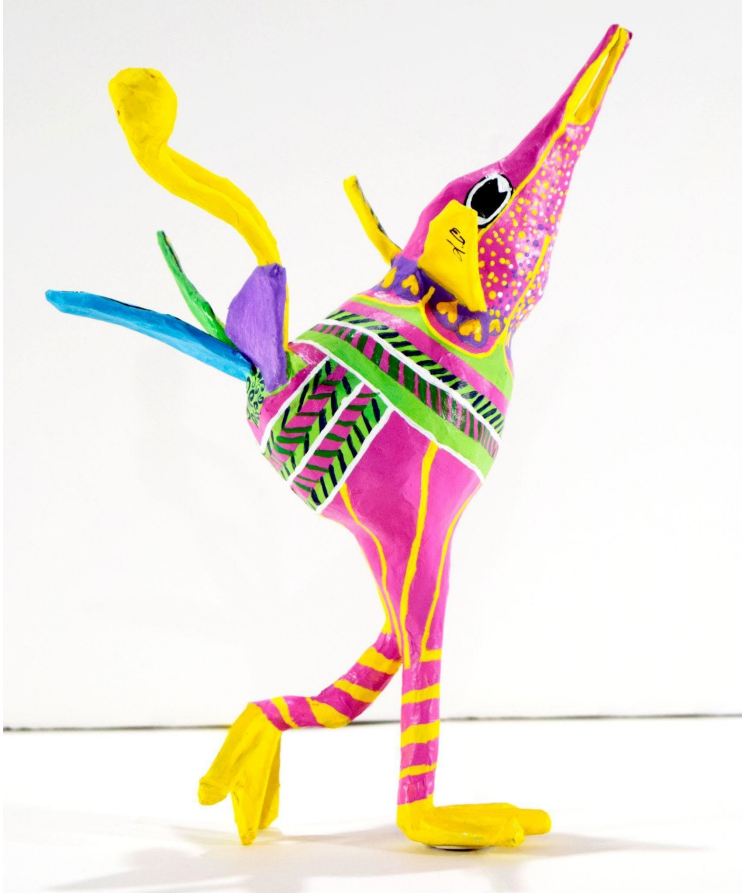
La Chuparosa (Hummingbird) Alebrije/Paper mache/Acrylic Paint 8x6x4 inches $300