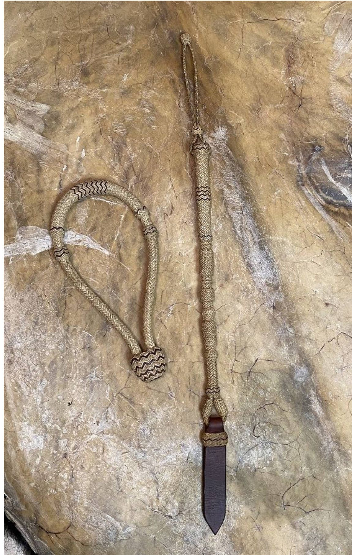
Rawhide bosal and rawhide quirt, $1500