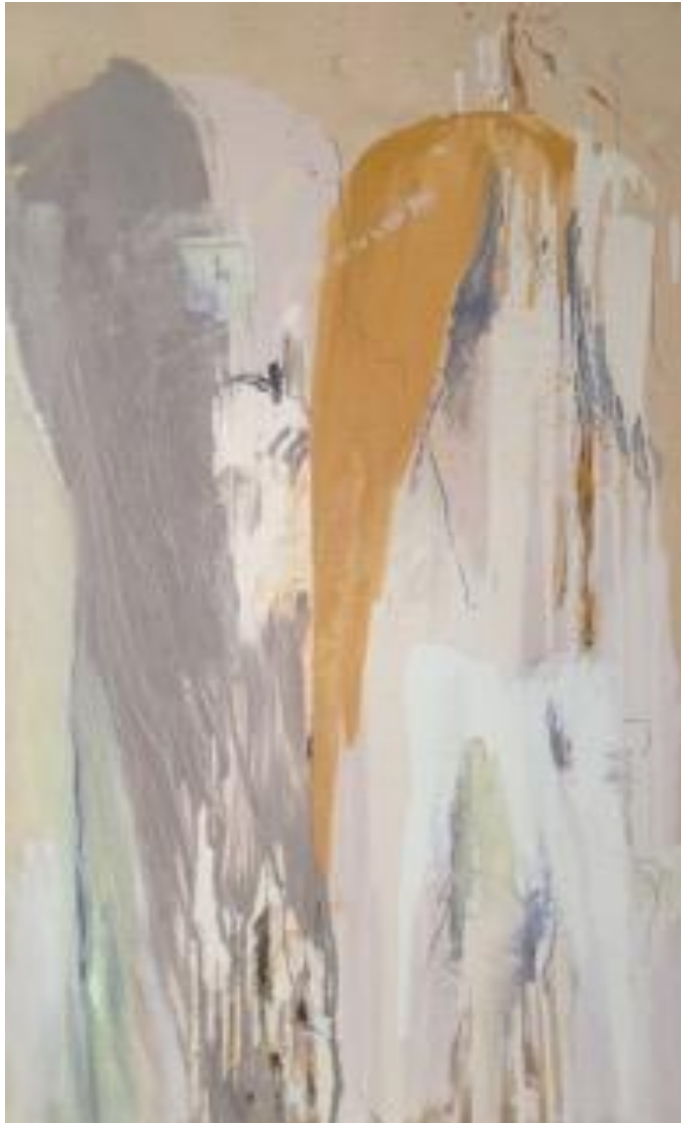
Emigration Canyon Fall II Oil on panel 2014 $2,100