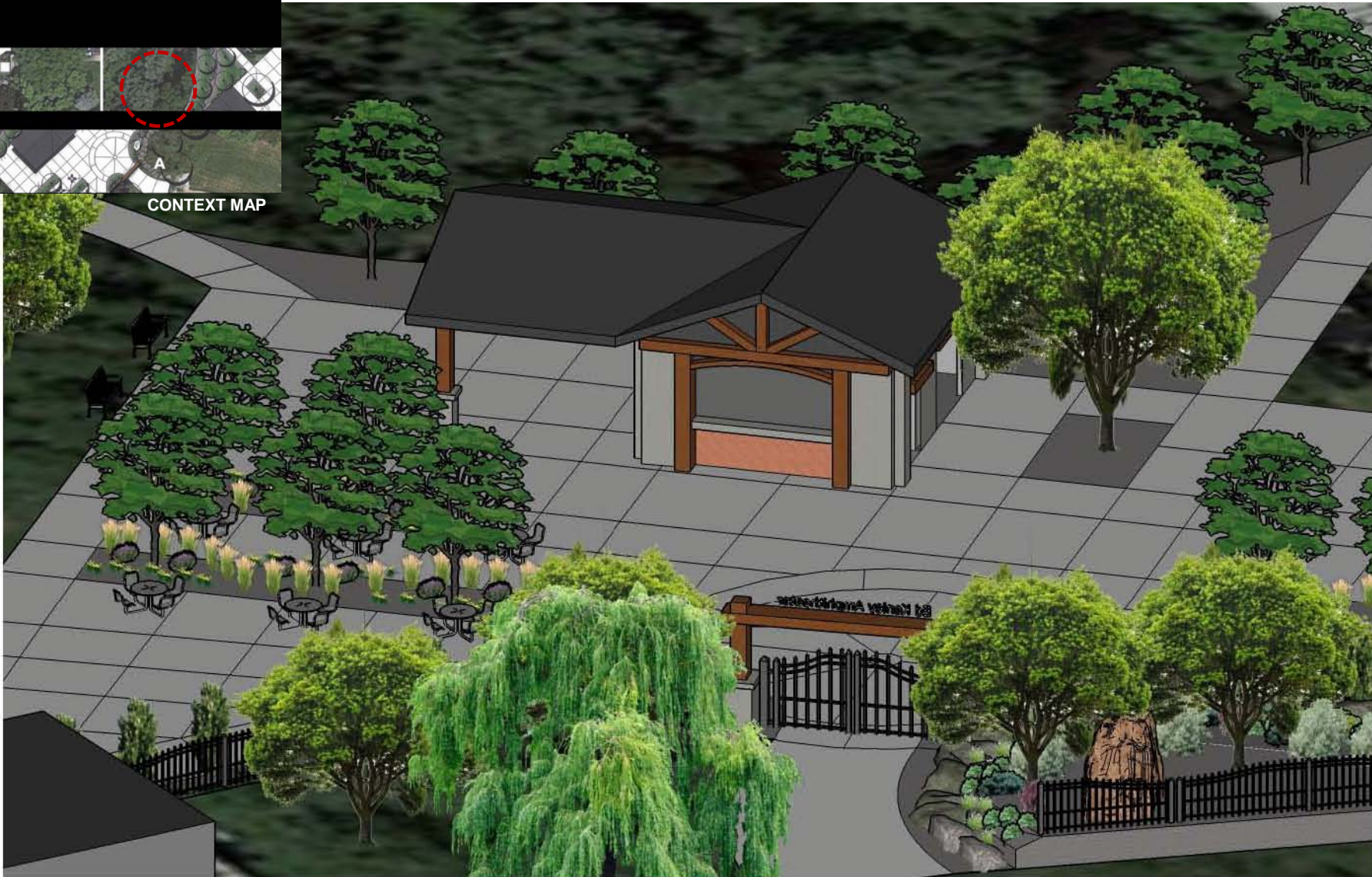
A. View to the west from inside the amphitheater of the pavilion including space for ticketing, concessions and restrooms.