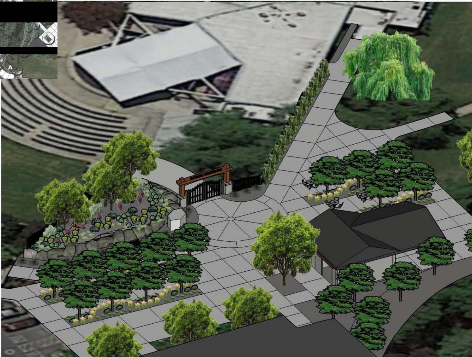
D. Bird's eye view to the southeast of the Kenley Amphitheater Plaza.