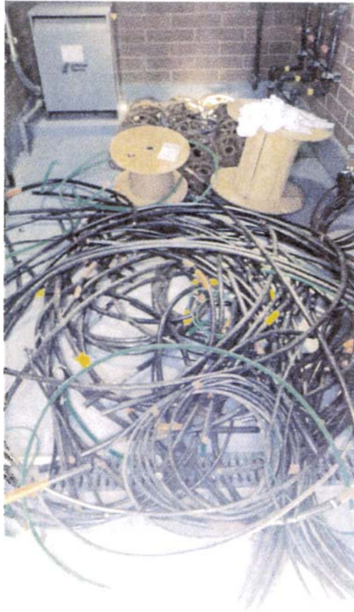
26- Brass spider gears that are loose Various- large copper wire pieces